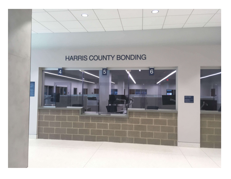
Bonding office in the Joint Processing Center, which the County expects will open on February 1, 2019, subject to further delays.

detained pending prosecution within the Harris County courts. The Sheriff's Office detains arrestees at the Harris County Jail and several other facilities. The officers and employees of the Sheriff's Office are authorized by County policy to accept money bail, as determined by the money bail schedule or by a judicial officer, and release arrestees.