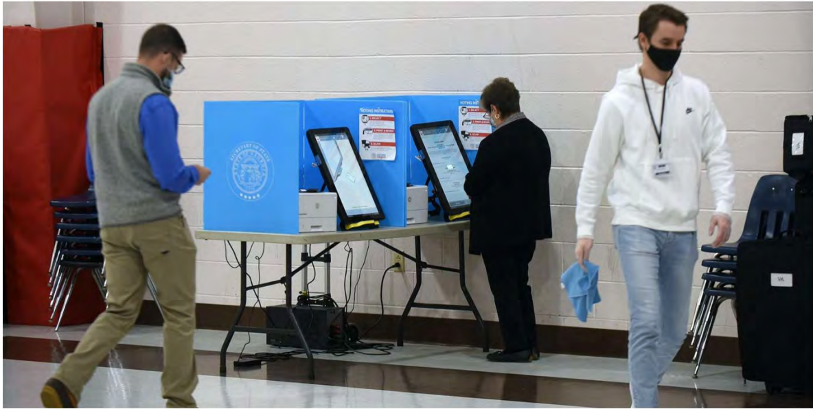
© Paul Hennessy/NurPhoto via Getty Images Voters are seen at a polling place at Varnell gymnasium on January 5, 2021 in Dalton, Georgia, USA. Paul Hennessy/NurPhoto via Getty Images