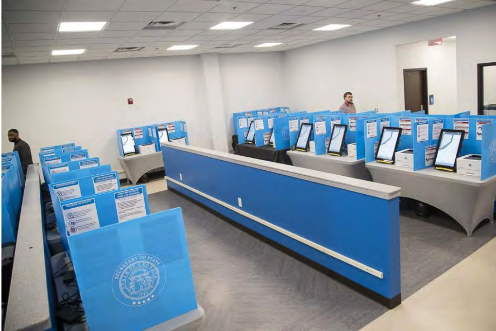
Figure 4. Gwinnett Elections Office Polling Place

434. Figure 5 is a true and correct photograph taken by an Atlanta Journal Constitution photographer of the inside of the Cartersville polling place, in Cartersville, Georgia, taken in early voting in October 2019, during the November 2019 election.