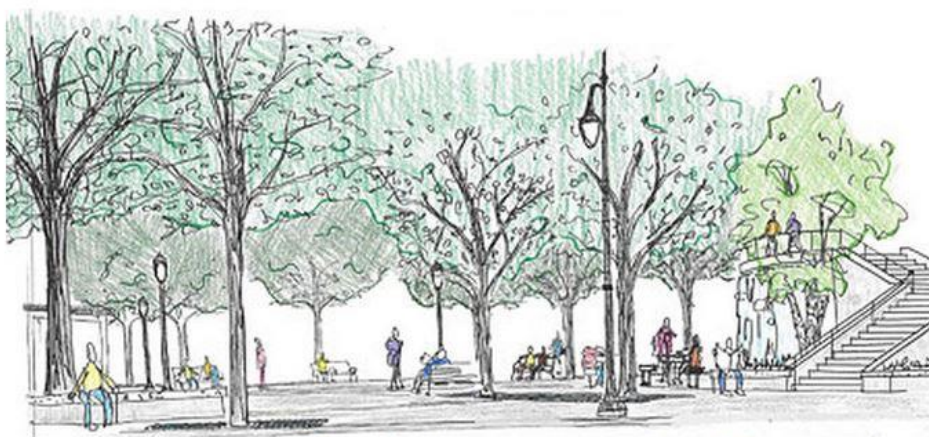
Top: Current engineering sketches for the Starburst intersection. Bottom: Plaza concept sketch from the H Street-Benning Road Great Streets project. Click to enlarge.

129. The Starburst Intersection Plaza is a broad plaza with broad walkways and the District installed benches and chess tables and chairs and other furniture which invite people to sit and spend time in the park.