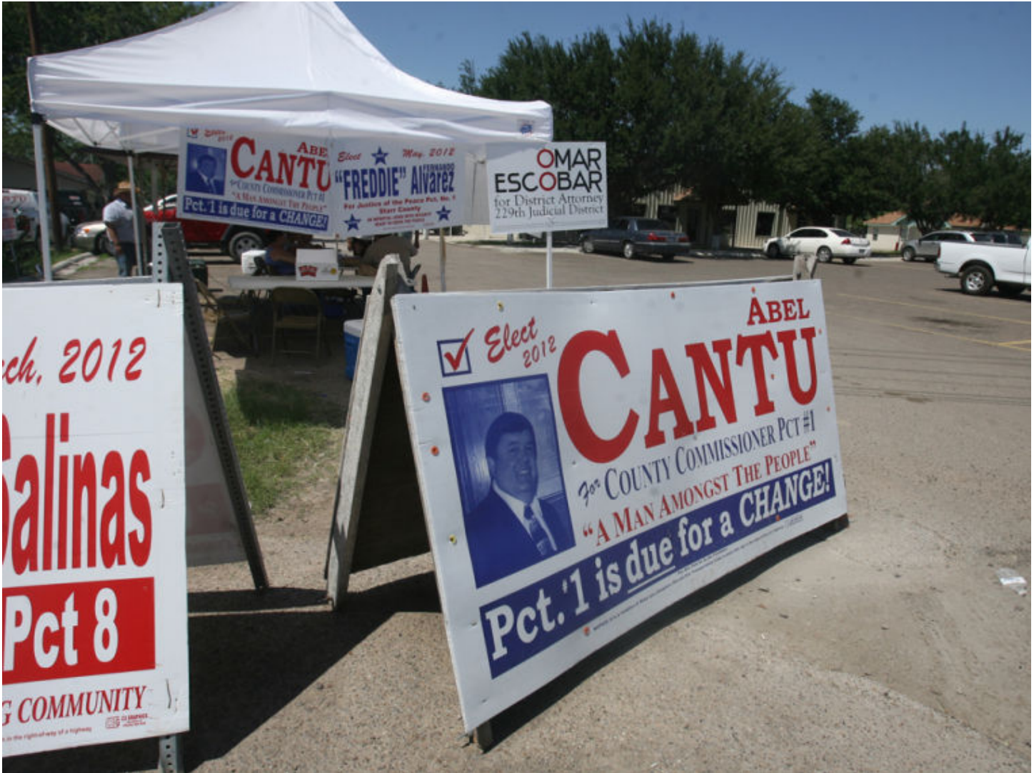
RIO GRANDE CITY, TX - 22 MAY 12 Political signs hang near the polling place at La Rosita during early voting May 22, 2012 in Rio Grande City.