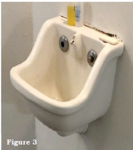
Detainee Cell Sink with Missing Hot Water Button