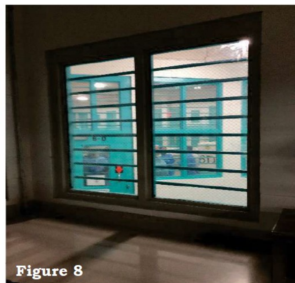
Figures 7 and 8. Detainee Housing Unit Control Room without Posted Officers (left) and with Poor Sight Lines through Barred and Dirty Windows (right)