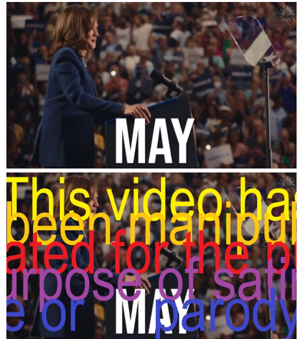
Figs. 1 & 2: A still image from Plaintiff’s video and an illustrative effort to include the mandatory labelling.

101. Although Plaintiff intends for his videos, like the Kamala Harris ones, to constitute political parody and satire, neither AB 2655’s “satire or parody” exemptions, nor AB