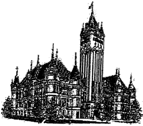
SPOKANE COUNTY COURT HOUSE

1116 WEST BROADWAY • SPOKANE, WA 99260-0350 (509) 477-4766 • FAX (509) 477-5714 dept5@spokanecounty.org