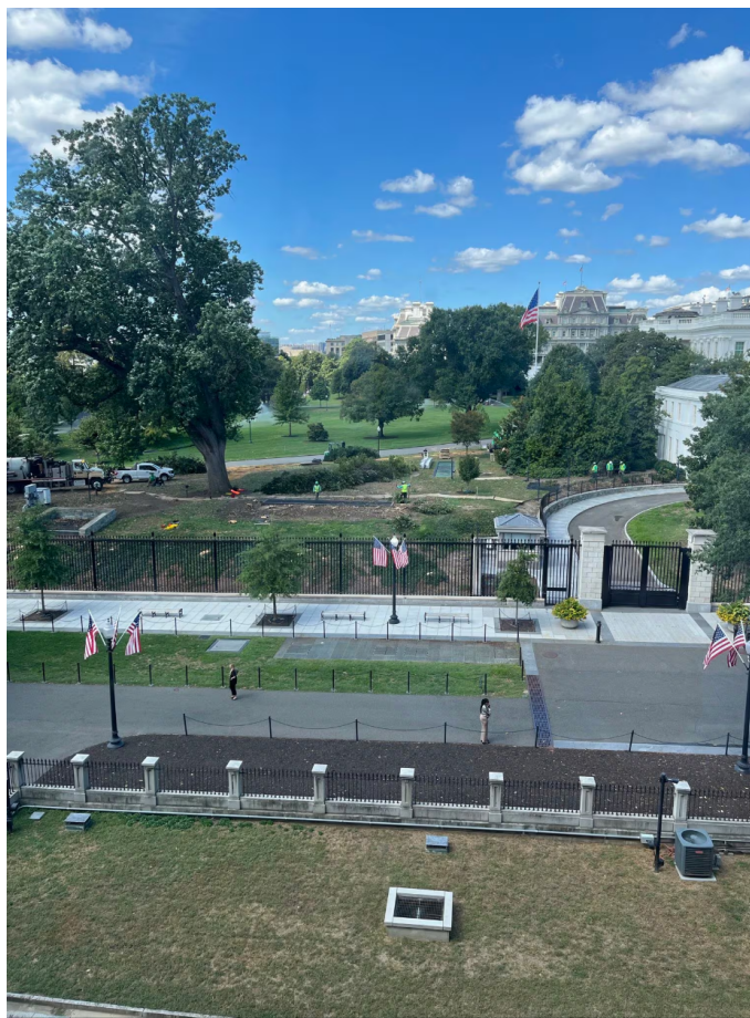
Figure 2 – View from the White House toward the North Lawn and Executive Avenue showing early demolition activity and tree removal at the former East Wing site.

21. On July 31, 2025, the White House issued a press release announcing plans to build a “White House State Ballroom” on the White House grounds to host “substantially more guests” than the current structure allows. The press release stated that “[t]he site of the new ballroom will be where the small, heavily changed, and reconstructed East Wing currently sits.” The release stated that “[t]he project will begin in September 2025.”