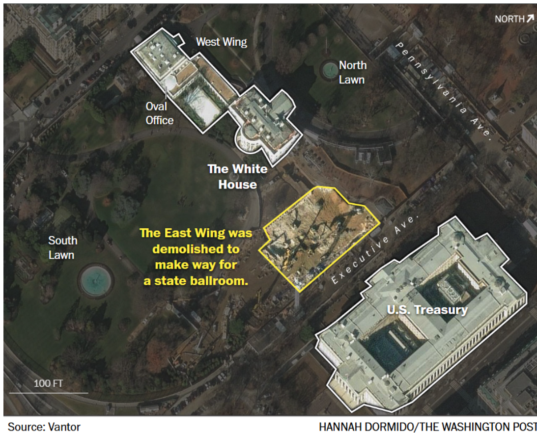
Figure 4 – Aerial view of the White House complex showing the West Wing, Oval Office, South Lawn, North Lawn, U.S. Treasury, and the former East Wing site marked as demolished to make way for a state ballroom. The Washington Post.

34. Because of the extensive use of asbestos in building construction for several decades, repair, renovation and demolition of existing structures are a major pathway of asbestos exposure by construction workers, building occupants and bystanders. Assuring the safe removal and disposal of asbestos fibers during these activities has been a high priority of federal, state and local regulatory agencies.