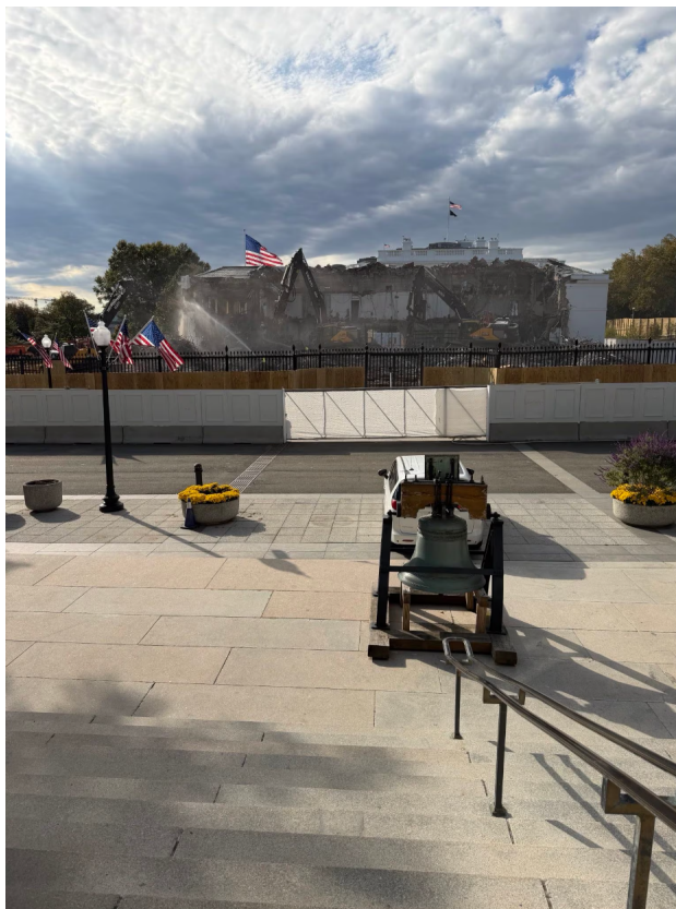
Figure 3 – View from Pennsylvania Avenue of active demolition of the East Wing, with excavators tearing into the structure behind security fencing, water spray controlling dust, and American flags lining the foreground walkway. The Washington Post.

26. Despite a request from Massachusetts Senator Ed Markey , the White House provided no details on whether the construction debris from the demolition had been tested for the presence of asbestos and, if so, whether the contaminated debris was sent to a disposal site equipped to manage asbestos waste.