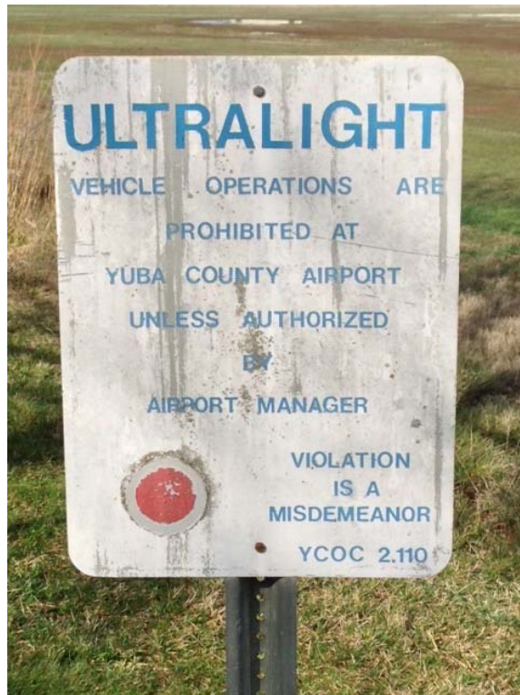
Figure 2. Sign located at main entrance at Yuba County Airport.

The Grand Jury is puzzled why the Airport Management has not exercised the authority provided in the aforementioned ordinance to relocate the ultralight operations to a safer, more suitable location.