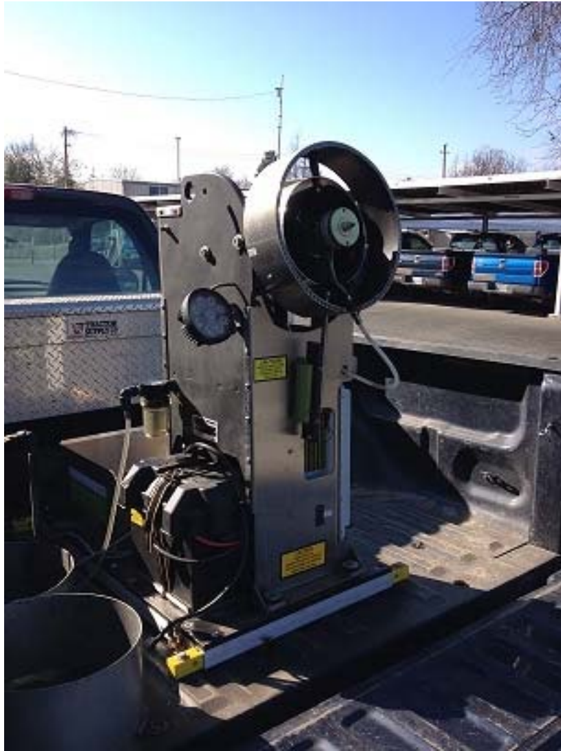
Figure 1. An example of a SYMVCD fogger unit. (January 2015)

A further example of the proactive nature of the District is that several members of the Board of Trustees and employees attend conferences held around the country sponsored by various Mosquito abatement associations and districts. At its annual conference last fall the Florida Mosquito Control Association's four day meeting featured a representative from a company called Oxitec. The representative presented a lecture on the subject of genetically modified mosquitoes that could be used to reduce the number of biting female mosquitoes in an environment. Briefly, the way it works is Oxitec's workers begin by modifying a select swarm of mosquitoes then manually remove females, aiming to release only males, which feed on nectar and don't bite for blood like females. The modified males then mate with wild females whose offspring die, reducing