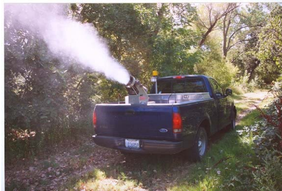
Figure 2. An example of a SYMVCD fogger unit in use. (January 2015)

the population. This technique is currently limited to Aedes Aegyptus mosquitoes which carry Dengue, and Chikungunya viruses. Oxitec is awaiting permission to release its modified mosquitoes this spring in Key Haven Florida, a neighborhood of more than 400 homes closely clustered on a relatively isolated peninsula at the north end of Key West. There are ongoing concerns that accompany any discussion which involves genetic modification of plants or animals. While genetic manipulation of any species of mosquitoes is still in its relative infancy, the mosquitoes responsible for transmitting WNV are just now getting attention from geneticists within the scientific community. The primary reason for low priority of concern over WNV is that compared to Malaria, West Nile Virus is not only survivable, but is much less debilitating, especially in the long term.