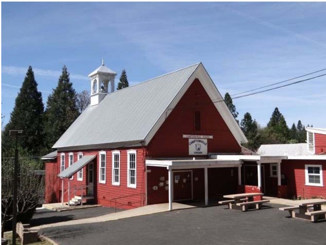
Camptonville Union School District (March, 2015)

The Grand Jury chose to investigate Camptonville Union School District because of its small size, remote location, and because it had not been investigated since 1990.